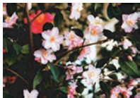
Tiny princesses resembling cherry blossoms