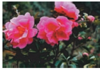
Peach-crimson flowers with a rare petal shape