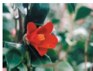
Red, beautiful niraikanai

The Scenery of the 88 Wonderful Sites of Tokushima Stretches Below In the roughly one hectare space of the park, three thousand individual flowers of seven types of wild camellia bloom all at once. From the park, one can look down upon the many island of Tachibana Bay, included among the " 88 Wonderful Sites of Tokushima."