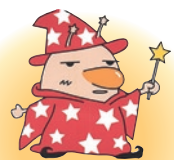
Illuminated City Anan Mascot LED ANAN

In 2002, the Anan Illumination Event began with the decoration of Ushiki Castle Park with 30,000 light-emission diodes(LEDs) donated by the world's first LED producers, a local Anan company, to the Anan Youth Association. Prompted by this event, in 2003, the city of Anan and the Anan Chamber of Commerce and Industry took a central role and set up the Anan Illuminated City Conference. The Conference works toward the goal of branding Anan as "The Illuminated City" utilizing the LED Illumination Event.